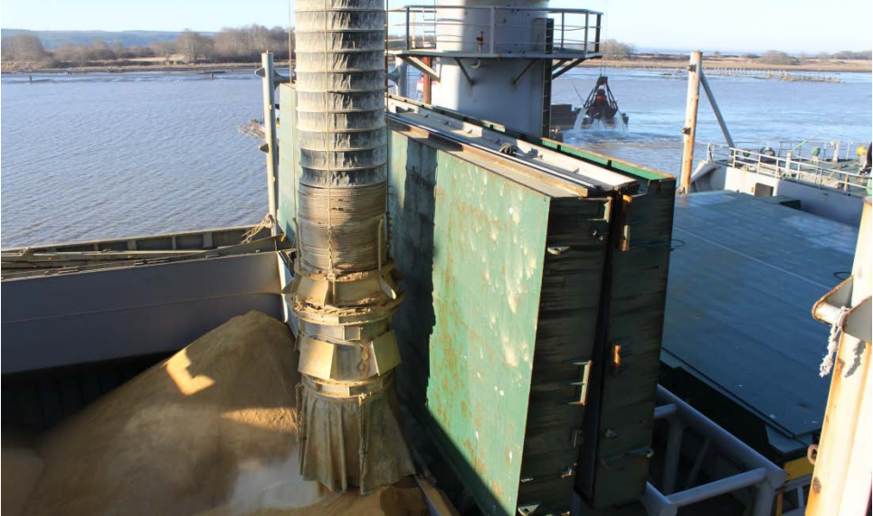
Distillers dried grains with solubles (DDGS) are loaded aboard a vessel at AGP's Storage and Export facility at Terminal 2 while American Construction works to dredge the Grays Harbor Federal Navigation Channel in the background. AGP exported a record amount of agricultural products through their facility at the Port of Grays Harbor in 2016.

Even with a strong U.S. dollar affecting trade again last year, the Port of Grays Harbor saw 98 deep-water vessel calls at their 4 terminals, which equated to more than 154,000 hours worked by longshoremen at the docks, the equivalent of 86 full time workers.