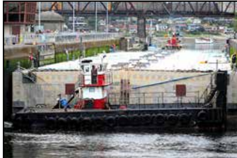
An aerial view (top) of pontoons under construction at the Grays Harbor casting facility; an ironworker (lower-left), perched three stories above the concrete floor of a pontoon, fastens rebar for the pontoon's wall; a 75-foot-wide pontoon (lower-right) squeezes through the Hiram M. Chittenden Locks in Seattle.