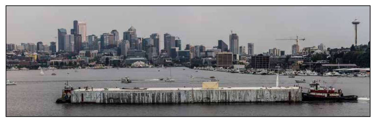
An Aberdeen-built longitudinal pontoon, guided by tugboats, crosses Seattle's Lake Union en route to Lake Washington.

After each cycle of concrete and steel pontoons was constructed in one of the two water-free casting basins, large gates opened to flood the basin. The pontoons – usually six or eight in a cycle – were then floated and towed out, either into the Chehalis River at Grays Harbor or Commencement Bay in Tacoma. Inspectors then thoroughly examined each pontoon, inside and out – even underwater – to ensure it met the bridge's 75-year design standard. Finally, the pontoons were towed, by tugboat, to Lake Washington. Depending on ocean conditions, the 260-nautical-mile journey from Grays Harbor to Lake Washington took about four or five days. The shorter trip from Tacoma took less than a day.