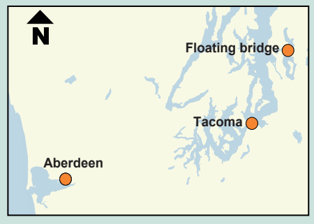
SR 520 pontoon and floating bridge construction sites

The backbone of the new bridge is its pontoons – 77 massive, concrete structures that will keep the new, wider bridge stable and afloat.